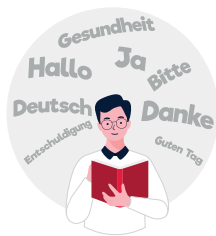
English-German Bilingual Programme (with Arabic)