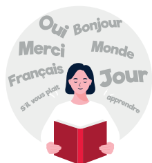
English-French Bilingual Programme (with Arabic)

SISD offers three different streams with an emphasis on offering learners the chance to develop international-mindedness, to broaden their skills and capabilities and to acquire the information needed to access other cultures: